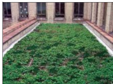
This green roof caps the Mellon Institute building at Carnegie Mellon University in Pittsburgh. It was installed by Green Roof Block, a Lake Saint Louis, Mo. company that installs the kind of aluminum planters Milunovich wants to install at New Canaan High School.